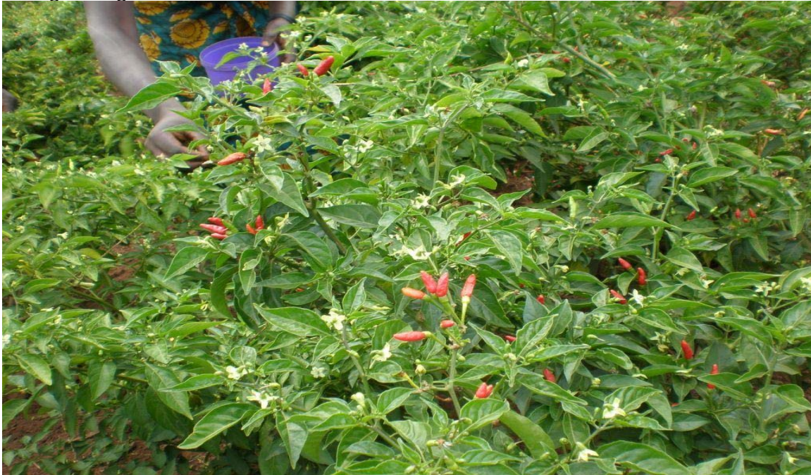
Plate (3): Women Picking Chili

Thirdly, link the local communities to markets for their produce – specifically chili markets. Fourthly, carry advocacy, publicity and sensitization compgains on biodiversity conservation and Bio-Trade Initiatives. Fifthly, conduct eco-friendly training programs in chili production techniques and post harvest handling. The training was supplemented by provision of extension services for red bird eye chili growing.