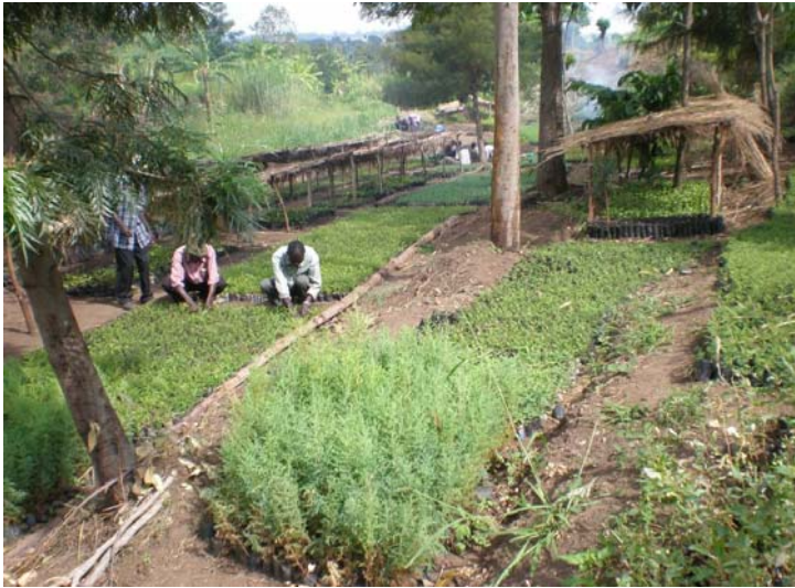
Plate (1): Tree Nursery at Namrwodho

pond is being constructed to help the community access fish for their consumption and the surplus for sale.