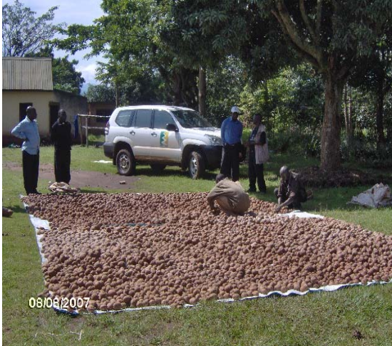
Plate (2) Irish Potato Field

For food security, sixteen thousand (16,000) mixed fruit seedlings (mangoes, jackfruits, passion fruits and avocado) were procured & supplied to the farmers to establish an orchard. In addition twenty five (25) bags (2 tones – 2,000 kgs) of improved Irish potato seeds were purchased and distributed to the farmers groups. The community was able to plant the seeds and harvested 55 bags (4,400 kgs – 4.4 tones). Thirty eight (38 bags – 3,000 kg – 3 tones) were sold at the cost of Ugx 15,000 (US$ 7.5) per bag, earning the community a total of Ugx 2,250,000 (US$ 1,125). Eighteen bags (18 bags – 1,400 kgs – 1.4 tones) were distributed to 50 families for food and seeds. In 2008 the community planted Thirty bags (30 bags – 2,400 kgs – 2.4 tones) but due to unfavorable weather, only 38 bags (3,000 kgs – 3 tones) were harvested. They sold 32 bags (2,600 kgs – 2.6 tones) earning the community Ugx 1,950,000 (US$ 975). Five bags (5 bags – 400 kgs) were eaten.