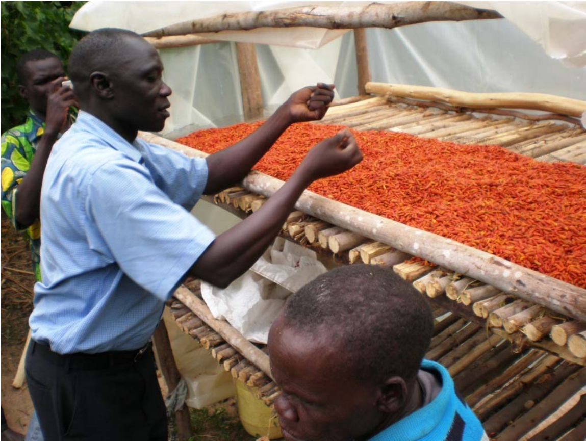
Plate (4): Chili Drying

Most farmers are still experimenting and so much of this production has been from back yard cultivation. Four agroforestry promotion campaign has been conducted including involvement of three FM Radio Station.