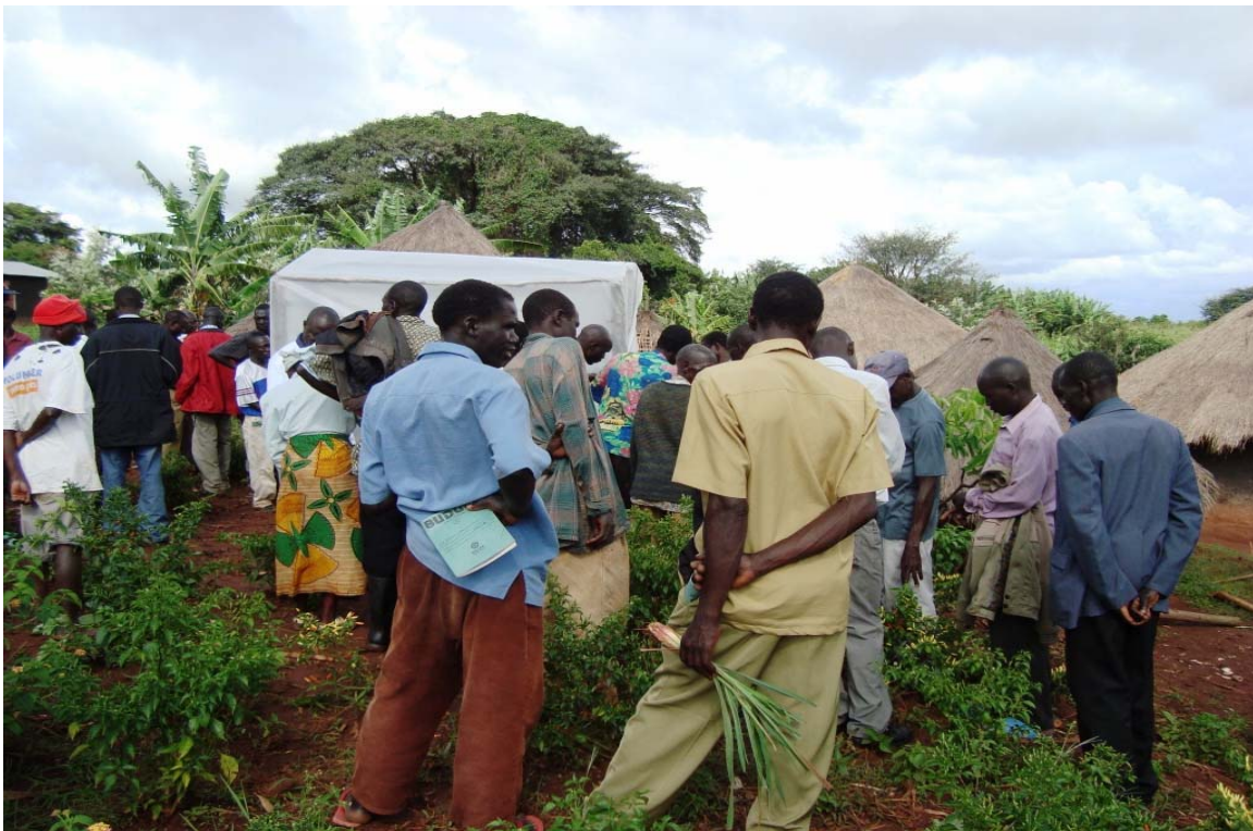
Plate (1): Partners at Work

The main partners to the project included the community members living in the focal sub counties in both Nyadri and Arua District, Arua and Nyadri District Local governments, local NGOs (like Vurra Patriotic Entertainers Group – VUPEG & Logiri Community Action for Development - LOCADE) and National Environmental Management Authority (NEMA).