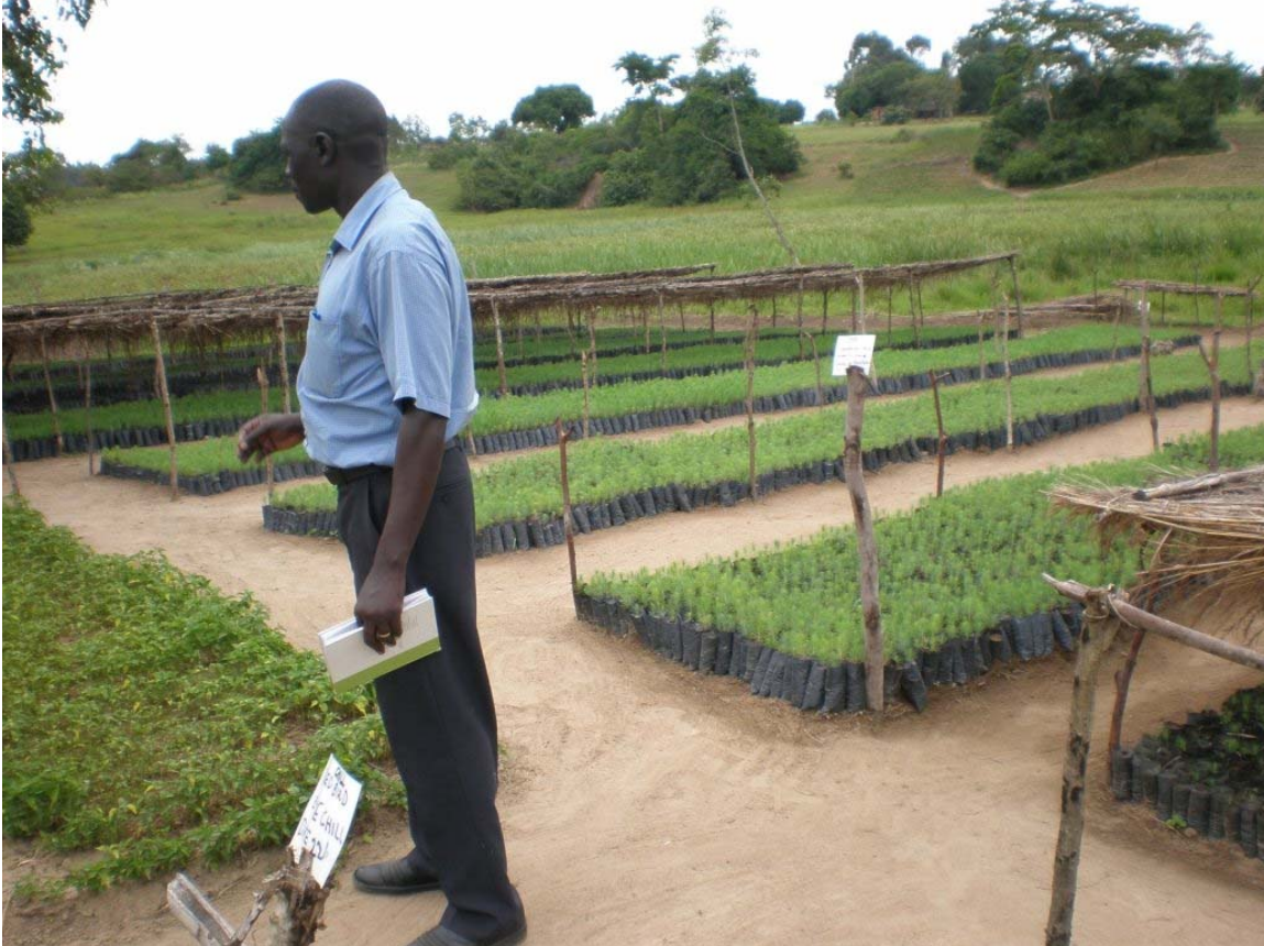
Plate (2): Nursery at Vurra Sub Country

The essence of this best practice takes into consideration 1) land degradation control, 2) diversification of sustainable subsistence farming, 3) Improving the standards of living of the rural communities through commercialization of chili farming, 4) Technology Transfer, 5) training programs in Eco-friendly farming techniques, post harvest handling, 6) Extension services, 7) Market Development, 8) Media Campaign Promotion, and; 9) Research. These key issues are elaborated further below.