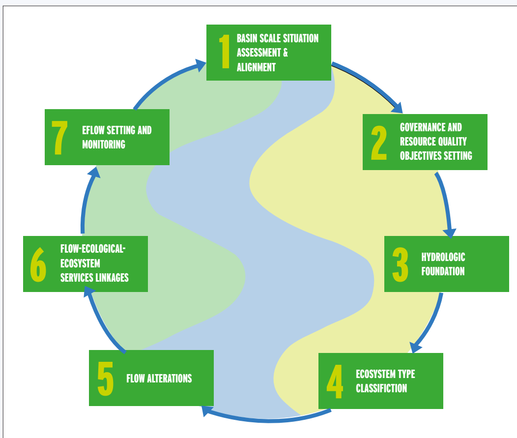
Figure 1: Summary of the seven phases of the Nile Basin E-flows Framework established to direct the management of E-flows in the Nile Basin.