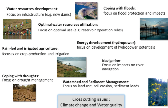
Fig. 1; Focus areas of the Nile Basin Decision Support System

It is this realization that spurred the riparian countries to embark, thru their flagship project, to jointly develop the Nile Basin Decision Support System with the aim of turning it into a shared analytic and knowledge system that supports joint planning and decision making.