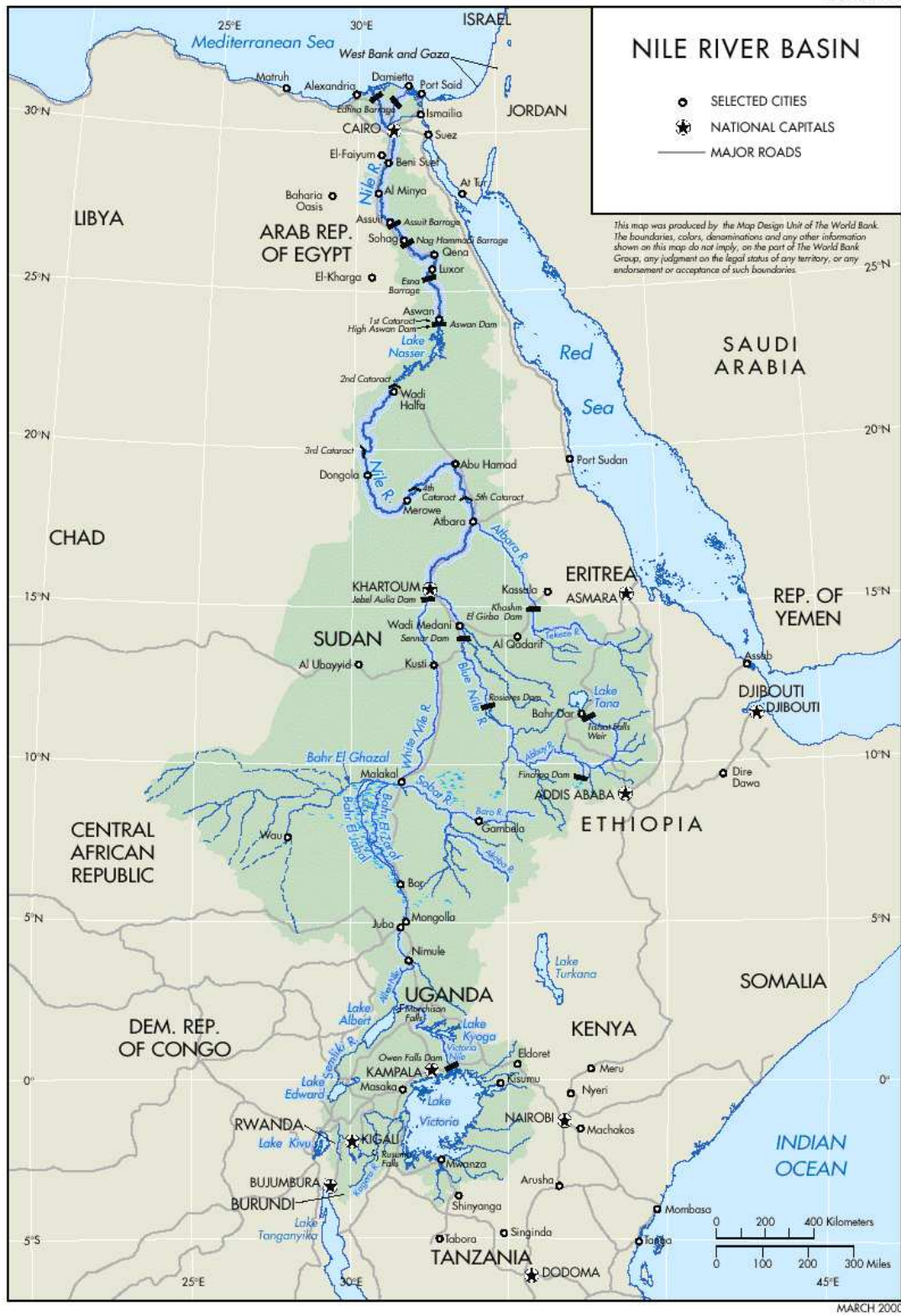
Figure 1-1 : The Nile River Basin