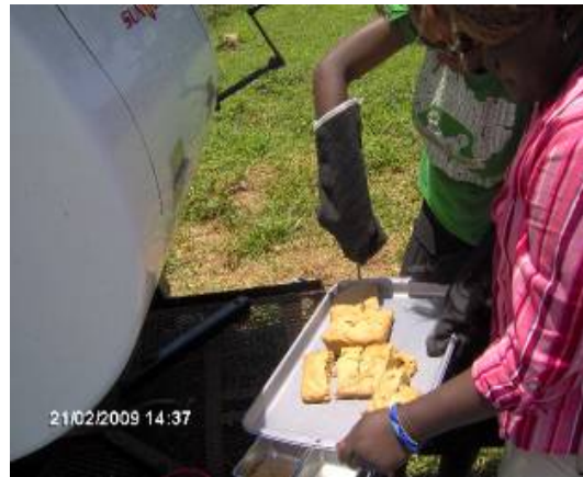
Plate (4): Use of Solar Cooker for Income