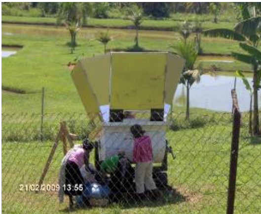
Plate (3): Training on use of Solar Cooker

The above remarks constitute important issues when similar projects are to be newly designed, disseminated or up-scaled.