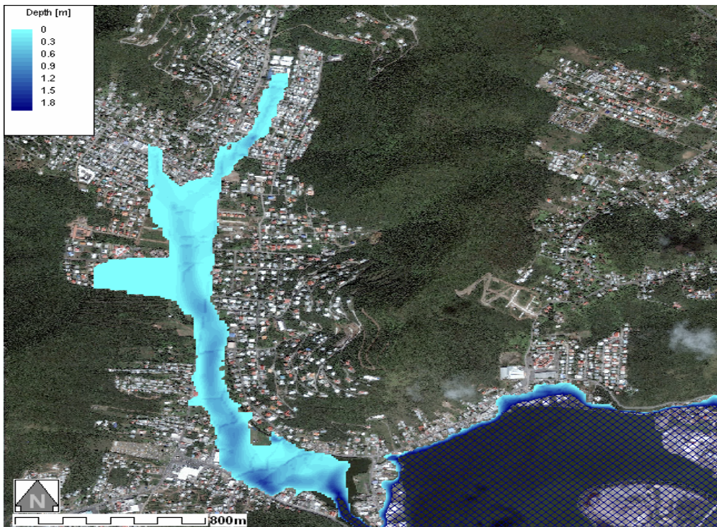
Figure 14: Water depth-Smooth with Roads DTM10_M30 Aerial Photo