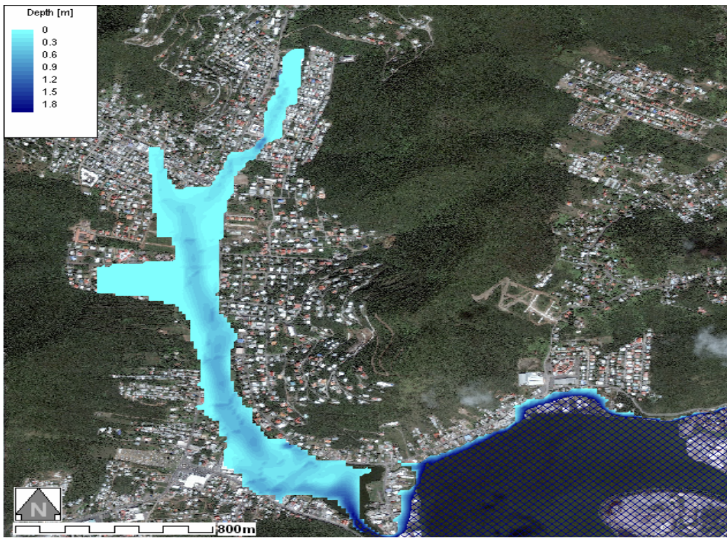
Figure 15: Water depth-Smooth with Roads DTM15_M30 Aerial Photo