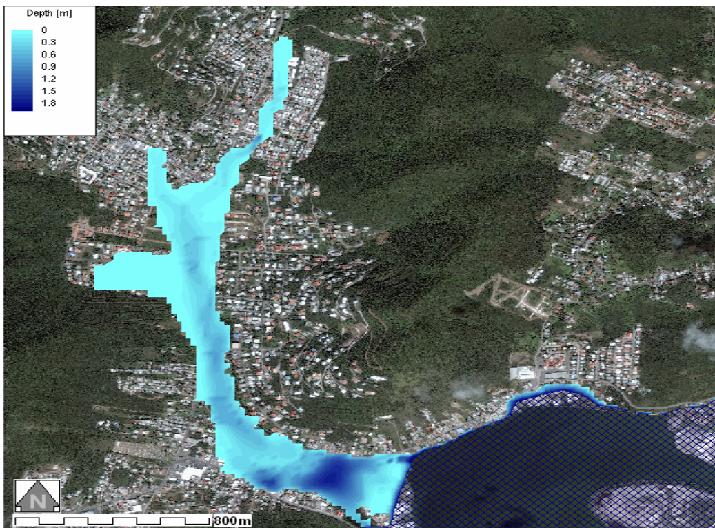
Figure 16: Water depth-Smooth with Roads DTM20_M30 Aerial Photo