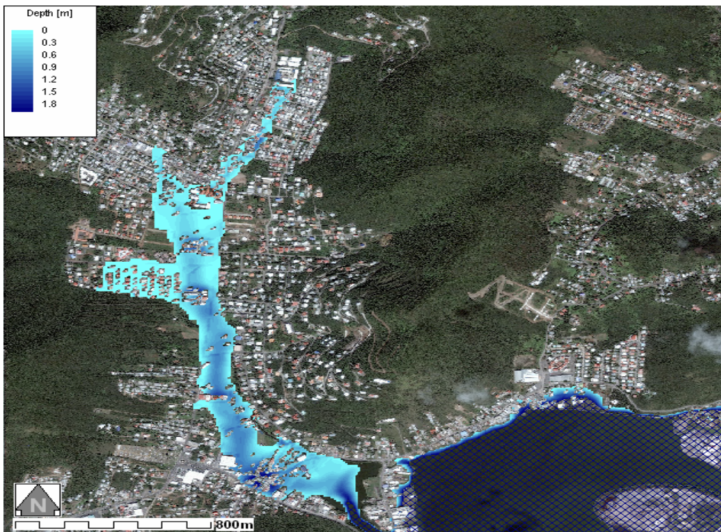
Figure 18: Water depth-Smooth with Road and Buildings_ DTM10_M20 Aerial Photo