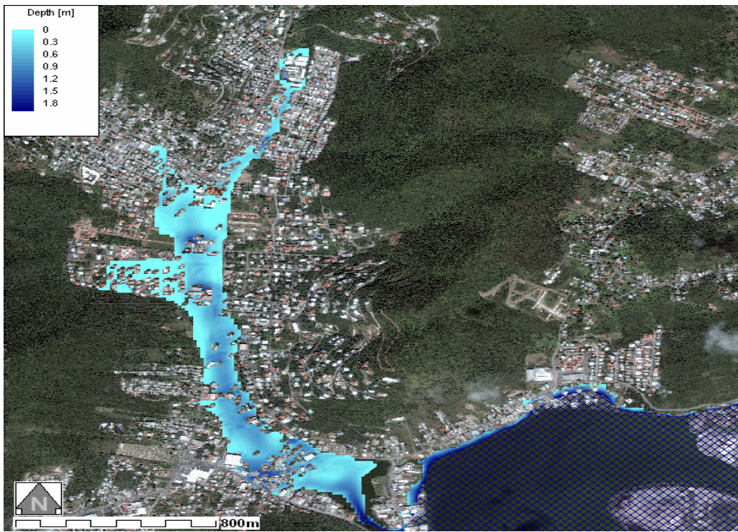
Figure 19: Water depth-Smooth with Road and Buildings_ DTM15_M20 Aerial Photo